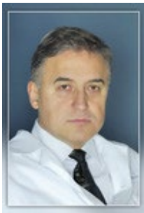
Attila Cziráki Heart Institute, University of Pécs