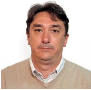
Dragan Lovic Clinic for Internal Disease InterMedica, Beograd