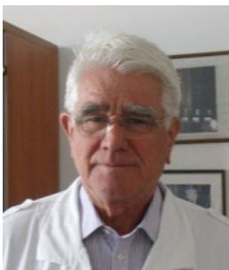
István Préda Cardiology Center, Semmelweis University, Budapest